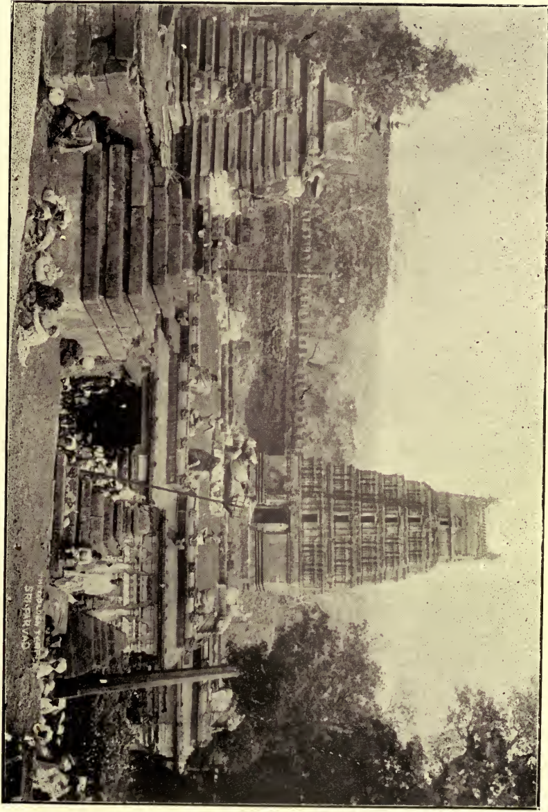
STATION AT MADRAS